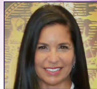
Hon. Nushin G. Sayfie Chief Judge of the Eleventh Judicial Circuit Court of Florida