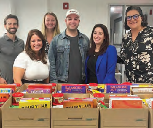
For spring break, the Council donated, packed, and delivered snacks for children who typically rely on school lunches.