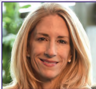
Hon. Cecilia M. Altonaga Chief Judge of the United States District Court for the Southern District of Florida

CELEBRATION AND JUDICIAL RECEPTION HONORING OUR EQUAL JUSTICE LEADERS