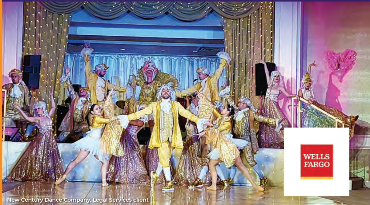
New Century Dance Company, Legal Services client